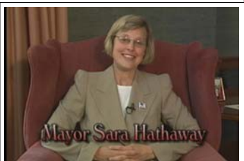
Mayor Sara Hathaway on set in her office at Pittsfield City Hall.

This program continues the tradition of the mayor having a program on PCTV, but