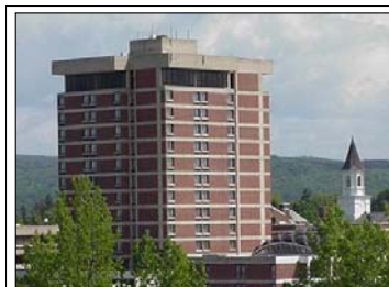
A view of the Crowne Plaza, the site of PCTV's Annual Celebration

the role of the Board of Directors in the organization. Watch for this program to be cablecast on Access Pittsfield in the